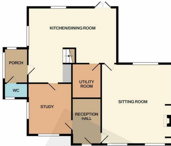
GROUND FLOOR APPROX. FLOOR AREA 828 SQ.FT. (76.9 SQ.M.)