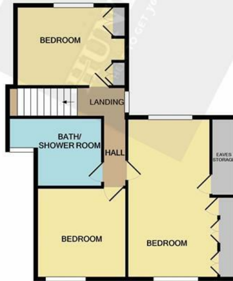
1ST FLOOR APPROX. FLOOR AREA 547 SQ.FT. (50.8 SQ.M.) TOTAL APPROX. FLOOR AREA 1375 SQ.FT. (127.7 SQ.M.)

Whilst every attempt has been made to ensure the accuracy of the floor plan contained here, measurements of doors, windows, rooms and any other items are approximate and no responsibility is taken for any error, omission, or mis-statement. This plan is for illustrative purposes only and should be used as such by any prospective purchaser. The services, systems and appliances shown have not been tested and no guarantee as to their operability or efficiency can be given. Made with Metropix ©2021